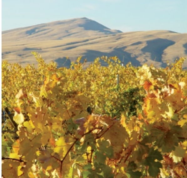
Above: Wineries have gained fame sourcing grapes from the celebrated Ciel du Cheval Vineyard in the Red Mountain appellation.