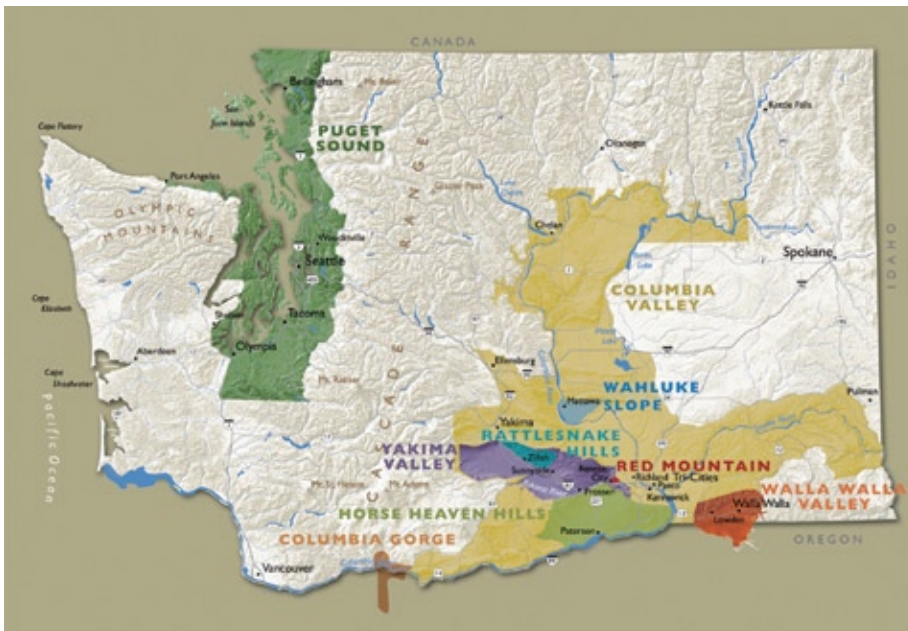
Washington's American Viticultural Areas (AVAs) with year approved, acres of vines planted, and leading variety: